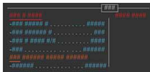
Figure 3. A version of the lower section of the ECAM display from an Airbus A330 aircraft with the colour retained, but text replaced by # marks. (Devised by Author 2)

There are two ways of considering this question of interest. The first is to ask whether colour alone is sufficient for the information presented in a coloured display to be processed correctly. Put simply, is it the case that seeing the colour is enough to see the information? The second way of considering this question of interest is to ask whether colour is necessary for the information presented in a coloured display to be processed. Put simply, is it the case that not seeing the colour means that the information is not seen?