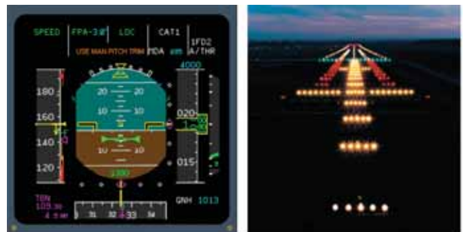
Figure 1. The left panel shows the Pilot Flying Display (PFD) of the Airbus A330. The right panel shows a typical runway lighting system with approach lighting.

Let us consider in turn each of the three assumptions identified above. There can be little doubt that there is extensive use of colour in systems used to present information in the aviation environment. This use of colour occurs inside modern aircraft where, for example, there is extensive use of coloured displays to present information to pilots. The use of colour also occurs in the aviation environment external to the aircraft, where, for example, there is extensive use of colour in runway and taxiway lighting at airports, and in devices such as PAPI used to help pilots maintain correct glide slope while on approach to landing. Figure 1 shows examples of this use of colour both inside the cockpit of a modern aircraft, and in the environment external to aircraft. More formal support for the truth of this assumption is provided by recent analyses of the aviation environment by Barbur, Rodriguez-Carmona, Evans, and Milburn (2009a, b) 2 in which they attempted to provide a classification of the role played by colour in this environment.