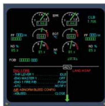
Figure 2. The ECAM display from an Airbus A330 aircraft showing the extensive use of colour in the display.

The question of interest is whether the colours used in the presentation of these different types of information in the ECAM display are required for the information to be processed correctly.